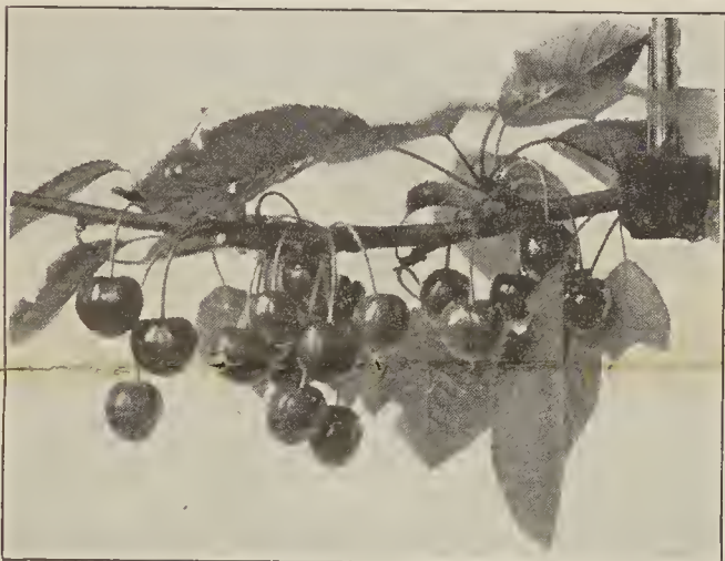
Large Montmorency Cherry